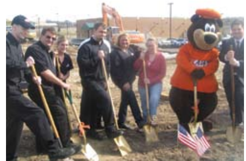
A&W Groundbreaking Ceremony on April 16th