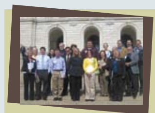
Dakota County Leadership Academy @ Business Day at the Capitol