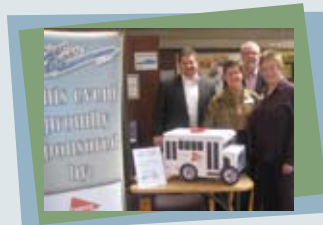
Business Card Exchange @ DARTS