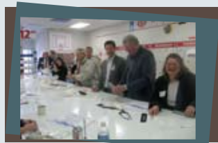
Business Card Exchange @ FASTSIGNS