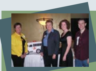
Baja Sol Restaurant Group and DARTS @ the Small Business Award Luncheon & Trade Show